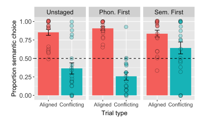
Figure 3: Average proportion of trials on which children choose the semantic cue for aligned vs. conflicting trials in Unstaged (Experiment 2 results, repeated from above), Phonology First, and Semantics First conditions (Experiment 3). Error bars represent 95% CIs. Colored circles represent individual participant means.