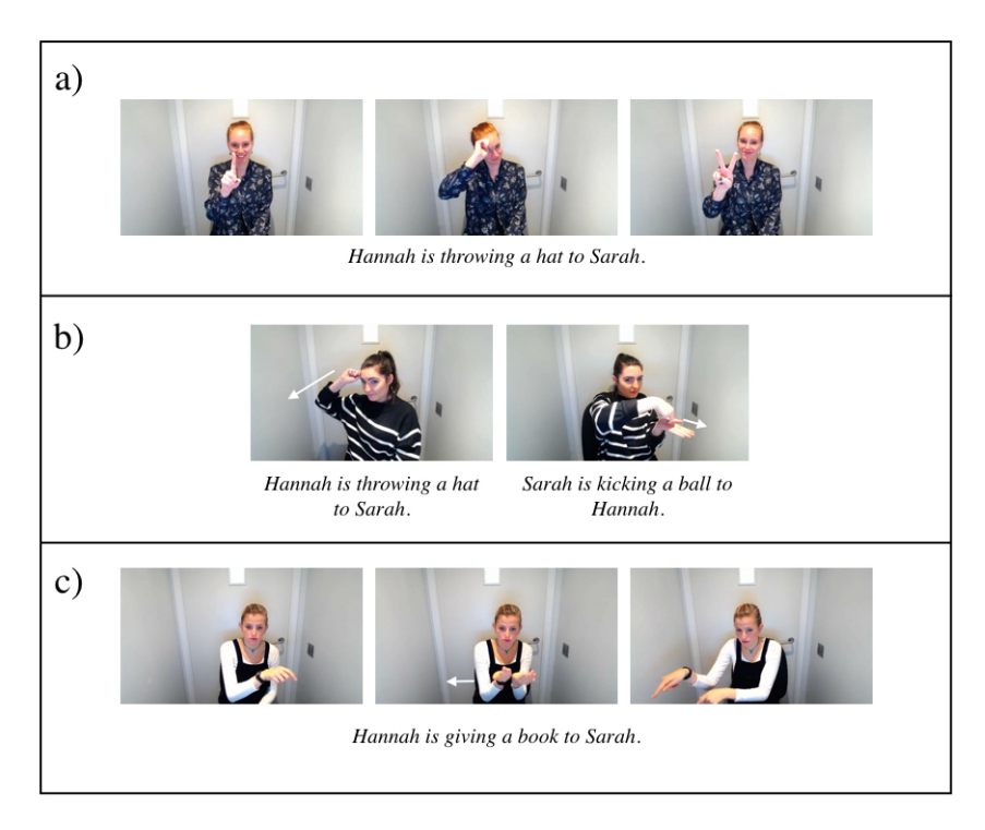
Figure 2: Examples of differentiation strategies used in the experiment. (a) shows an example of the lexical strategy, in which the participant uses 1- and 2-handshapes to denote arguments. (b) shows a participant using body orientation to denote sentence arguments. (c) illustrates the indexing strategy, in which the participant indexes locations to refer to sentence arguments.